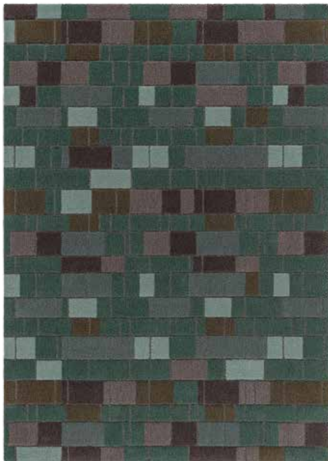
Rug 170x240 cm, Green 300